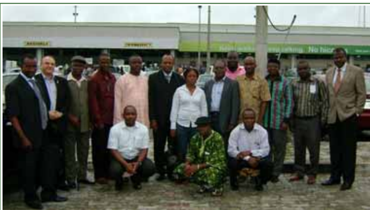
Some engineers at the Port Harcourt International Airport returning from Abuja after the 2009 COREN Assembly on the 13th of August 2009.

E-Newsletter: Thank you very much for the opportunity you have given us. We do hope that the government, industries and those who are not yet registered with COREN would learn. Once again thank you.