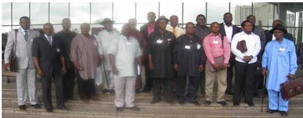
Some of the NSE PH members during the COREN Assembly