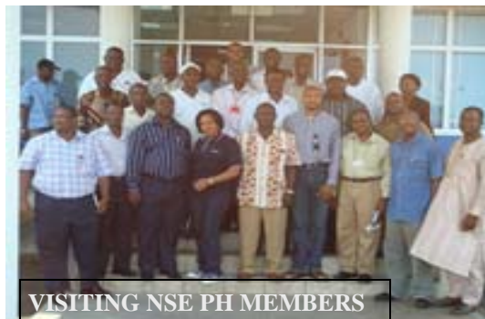
VISITING NSE PH MEMBERS