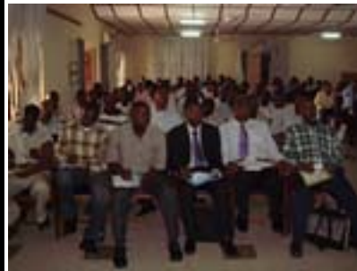
SOME PARTICIPANTS DURING SEPTEMBER 2006 SEMINAR