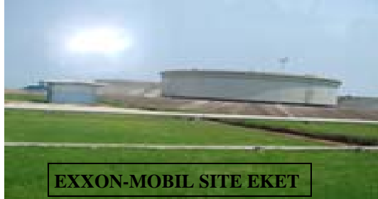
EXXON-MOBIL SITE EKET