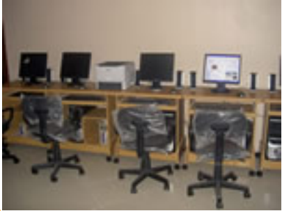
IT CENTER DONATED BY ISOC NIGERIA CHAPTER