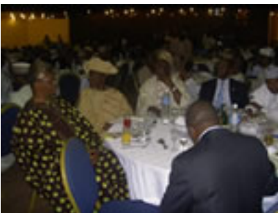
MEMBERS AT THE DINNER