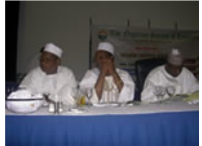
SOME GUESTS ON THE HIGH TABLE