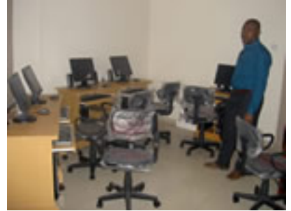
IT CENTER DONATED BY ISOC NIGERIA CHAPTER