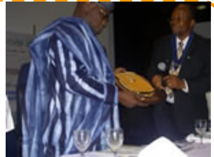
NSE PRESIDENT PRESENTS GOLDEN SERVICE AWARD TO OBASANJO