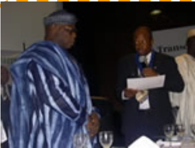
NSE PRESIDENT PRESENTS CERTIFICATE OF RECOGNITION TO OBASANJO