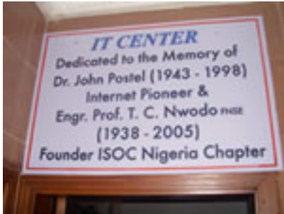
ENTRANCE OF THE IT CENTER