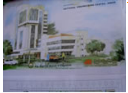
PROPOSED NEC CENTER