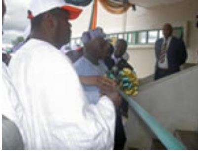
OBJ COMMISSIONING NEC ABUJA