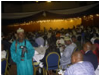
MEMBERS AT THE DINNER