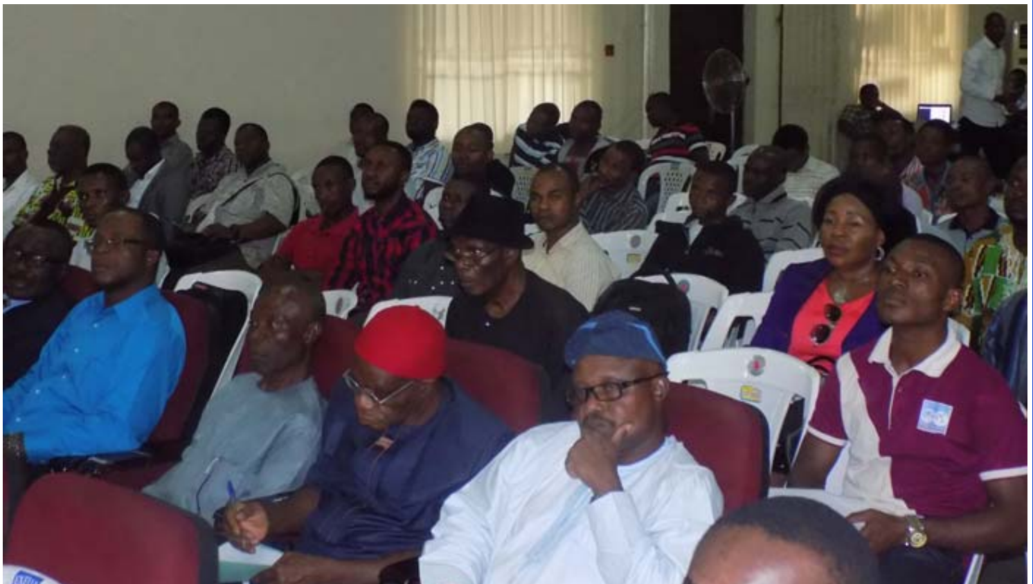
Cross section of members of the Nigerian Society of Engineers Port Harcourt Branch during the General Meeting / Technical Evening held on Thursday 28th July 2016 at Engr. Ishmael A. Banigo secretariat (the Branch secretariat) Port Harcourt.