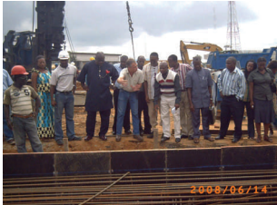
NSE PH team inspecting the Eleme junction fly over construction work.