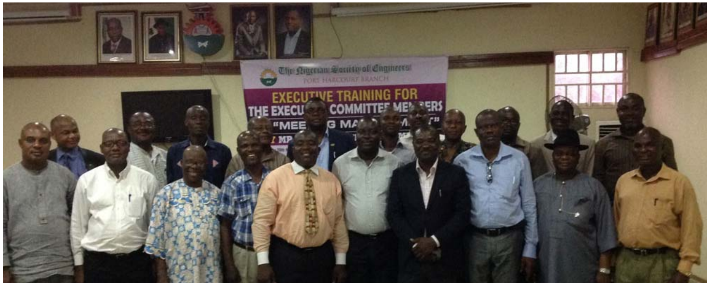
NSE Port Harcourt Branch Executive Committee members and the resource persons in a group photograph during a training on Meeting Management held on Thursday 20th March 2014 at Engr. Ishmael A. Banigo secretariat, Port Harcourt.