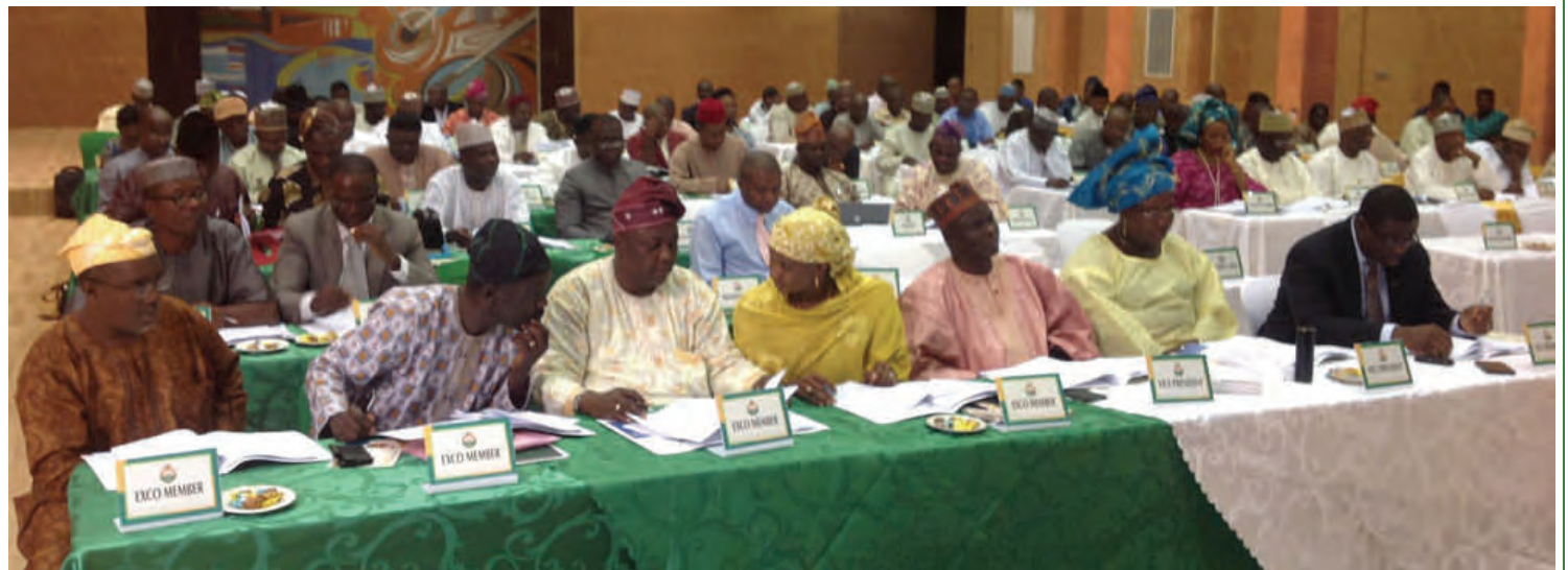
Executive Committee Members (front row & back row left & 2nd left) and other members at the Council meeting.