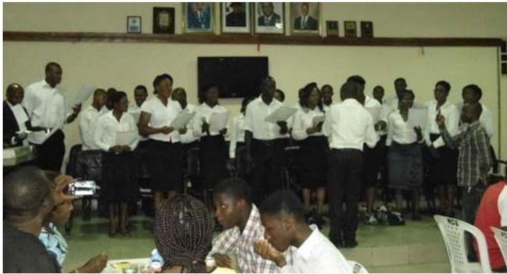
Mater Misericordiae Catholic Church Port Harcourt choir singing carol songs