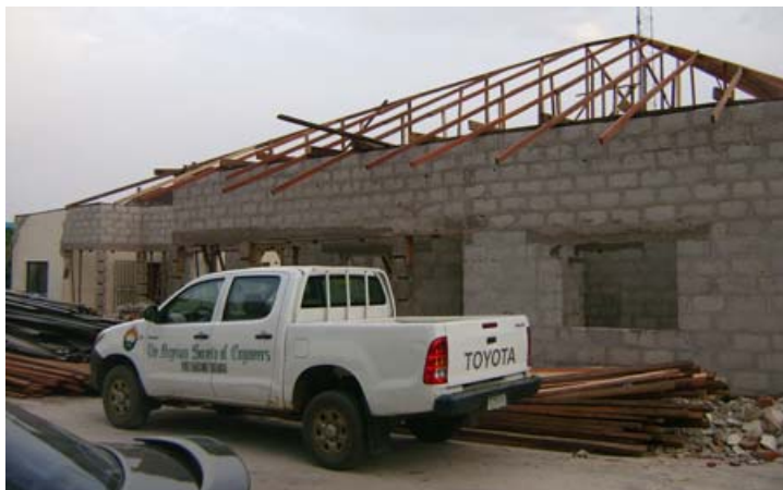
NSE PH Branch secretariat undergoing expansion