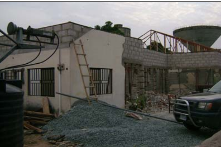
NSE PH Branch secretariat undergoing expansion

Notice: The Financial Status of Port Harcourt Branch members of the Nigerian Society of Engineers has been published in the branch website. Members should visit www.nseph.org to view their financial status. For more details call Admin Secretary on 08033166865.